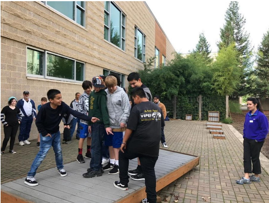
Sonoma State University