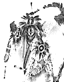
Assembly: Sewam Dance, Dances of the Plains Indians