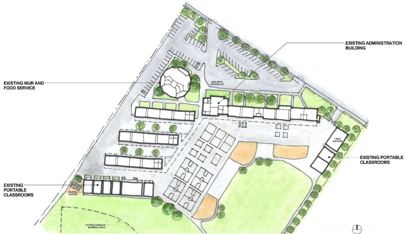
EXISTING SITE LAYOUT