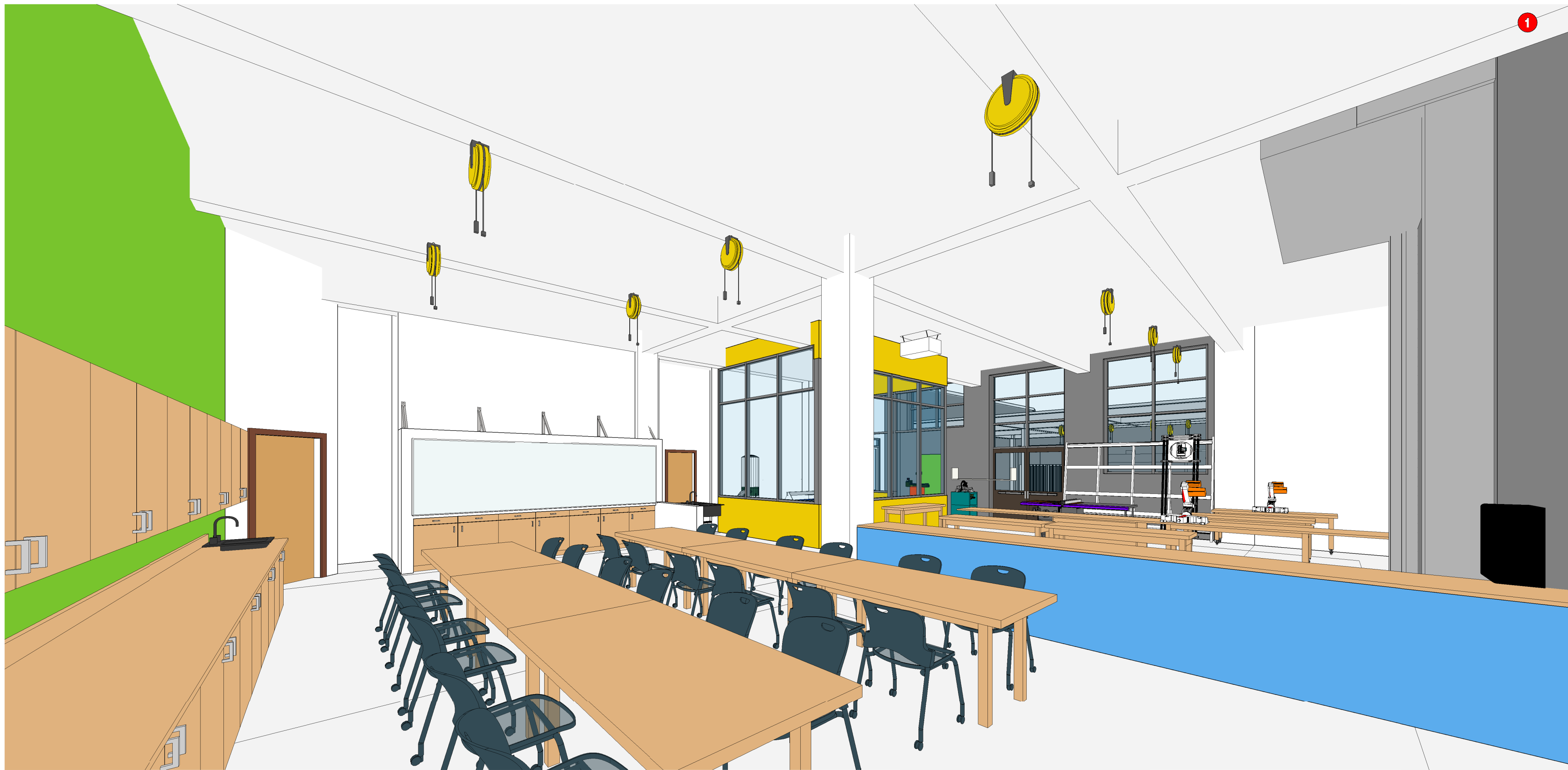
1 VIEW 1 - WORKSHOP 1 AREA A2.00