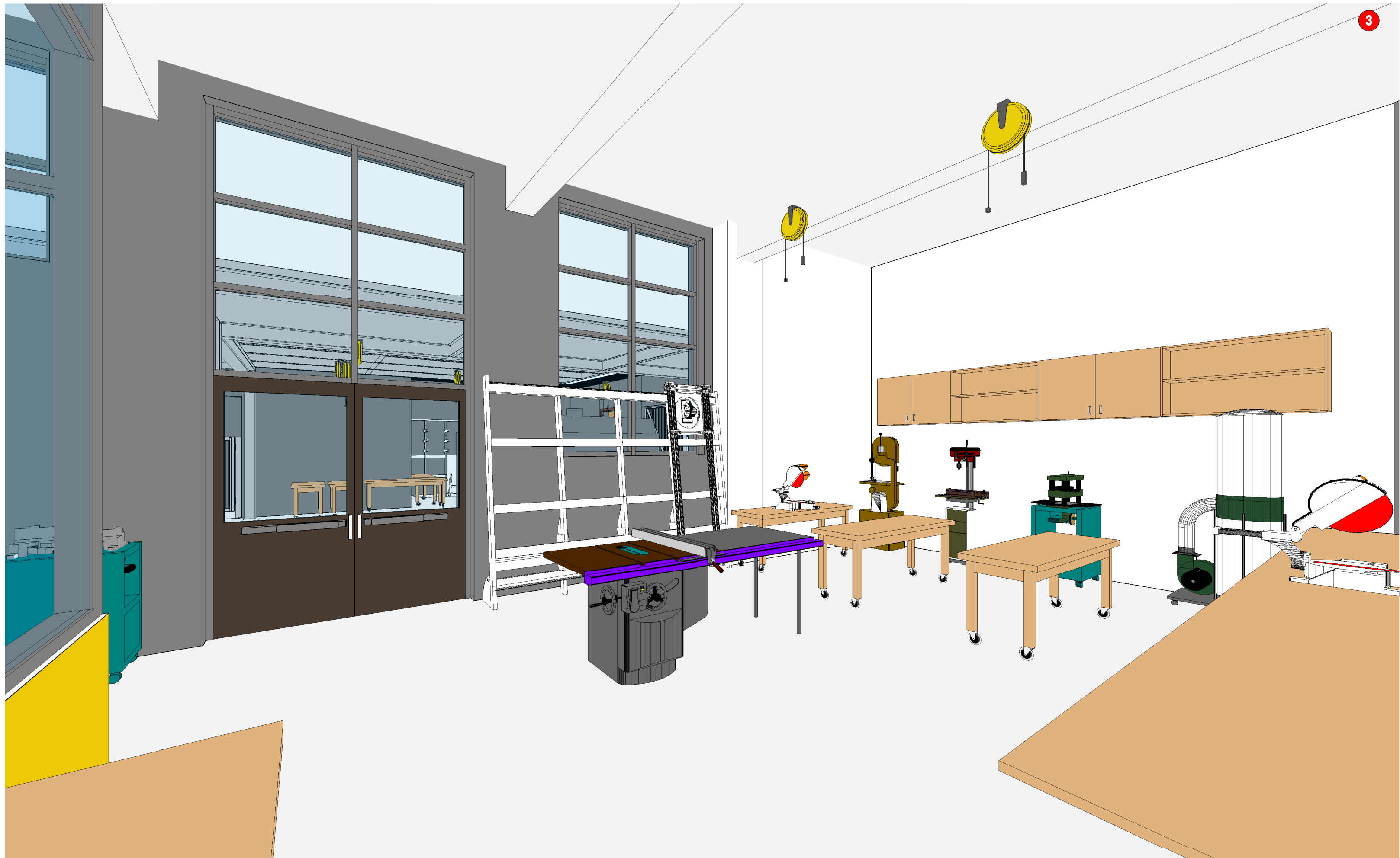
3 VIEW 3 - WORKSHOP 2 AREA A2.00