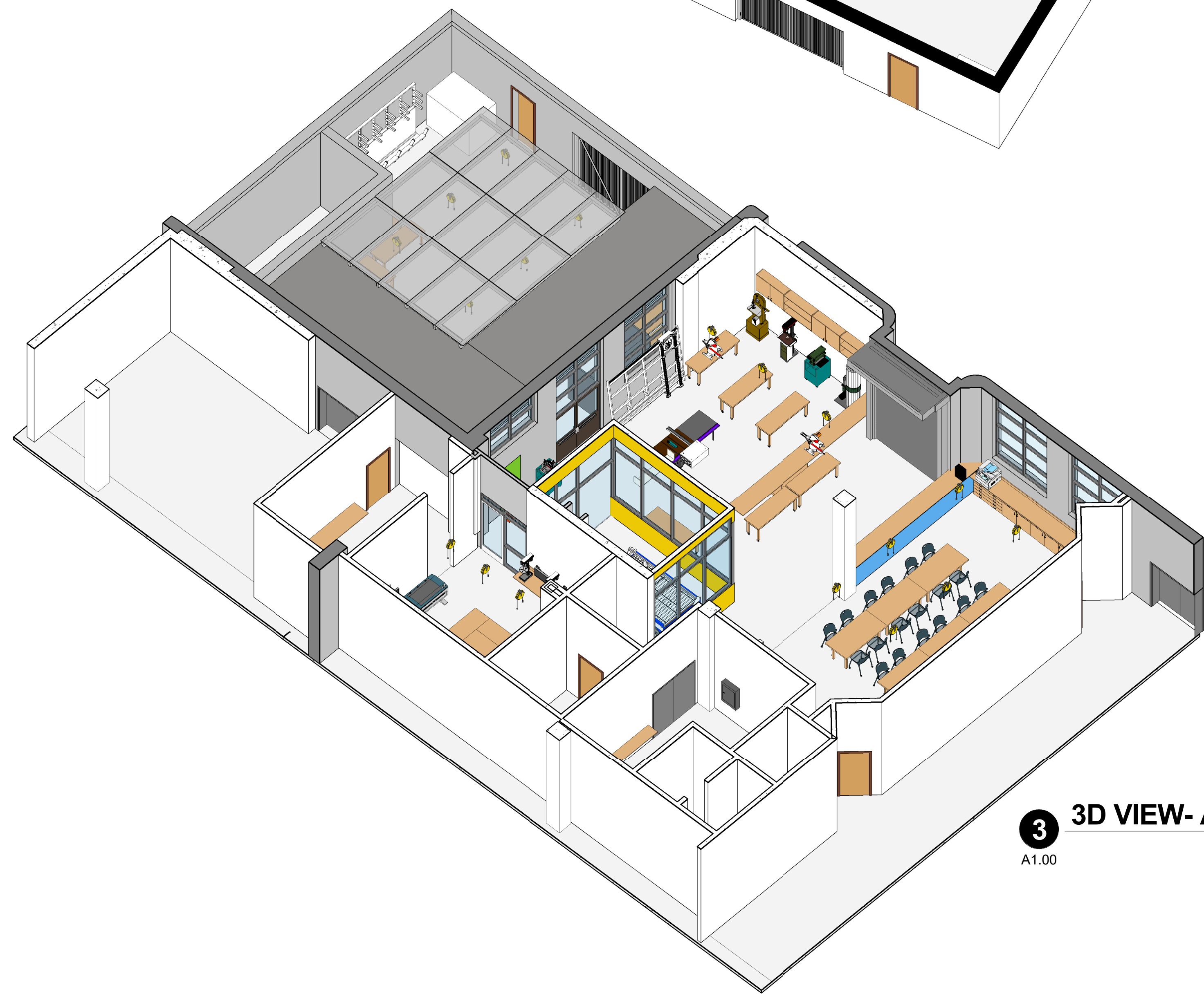
BUILDING G- PARTIAL FLOOR PLAN FIRST FLR - G112