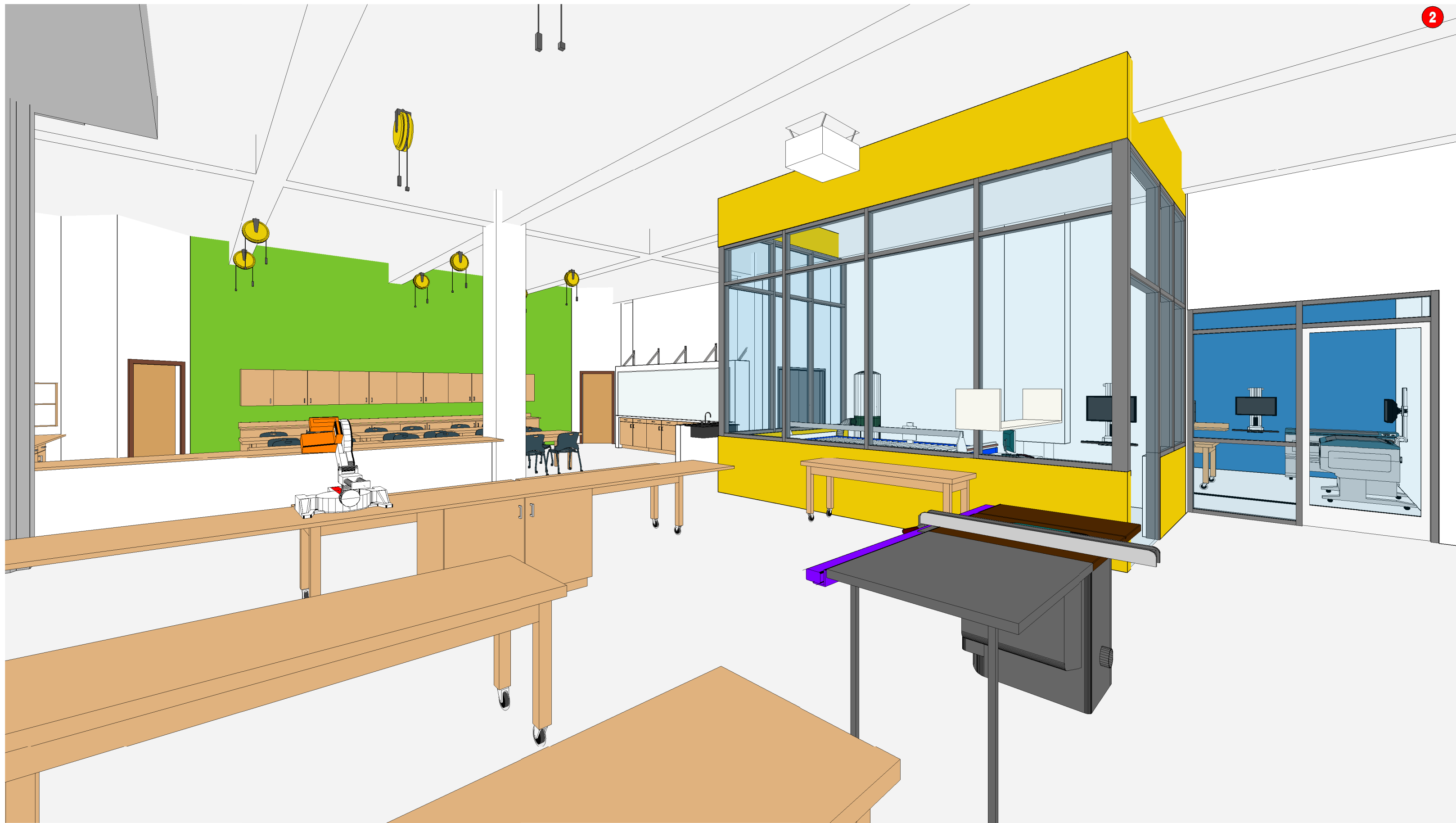
2 VIEW 2 - WORKSHOP 2 AREA/ CNC A2.00