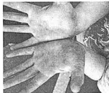
PlayItSafeAromas.org (CA). The black residue on a child's hands after playing on a TDP playground. https://benitolink.com/rubber-tire-mulch-removal-playgrounds-school-board-agenda .

In the absence of conclusive scientific research, a number of investigations identifying the presence of lead and other toxins in TDP have led to child safety concerns about such products. 15 After playing on crumb rubber and other TDP surfaces, some children have left with blackened hands and faces. 16 TDP has also been suspected of causing other health issues, including cancer. 17 As a result of these and other concerns, school districts and other agencies around the country have begun limiting or banning the use of crumb rubber and other TDP in fields and playgrounds. 18