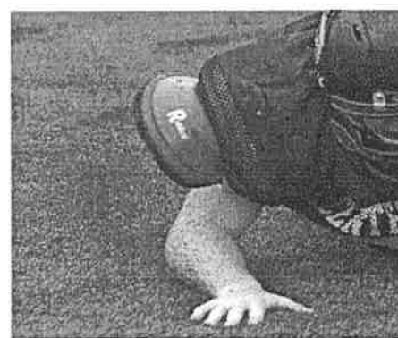
Crumb rubber infill pellets on playing field at Centerville High School, Centerville, OH.

Installing synthetic or artificial turf (AT) used to refer to replacing grass with what was essentially a green-painted, rough plastic carpet with “blades” designed to look like real blades of grass. AT now contains “ infill ” material between the blades to soften the surface of the turf and to provide cushioning. These infills may be composed of organic products (see below) or crumb rubber. Crumb rubber is widely used in the synthetic sports field and landscape market. The most popular type of AT infilled with crumb rubber — Fieldturf® — is used extensively in athletic fields and stadiums and generally lasts for eight to ten years. 4