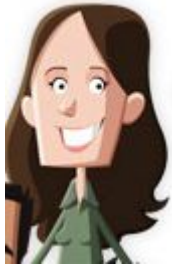
Physics 1 Teacher