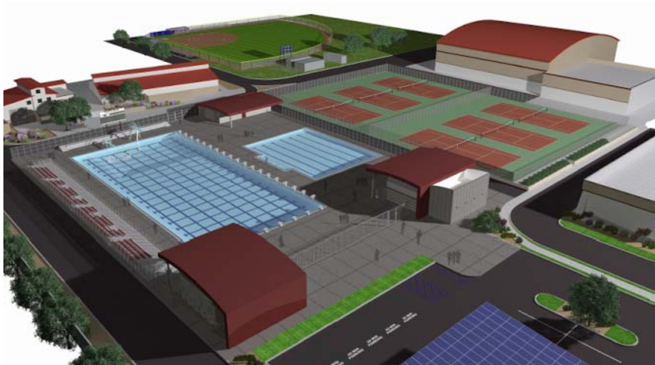
Artistic Rendering of Completed Complex