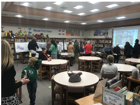
Community outreach at Pat Butler Elementary 1/17/18