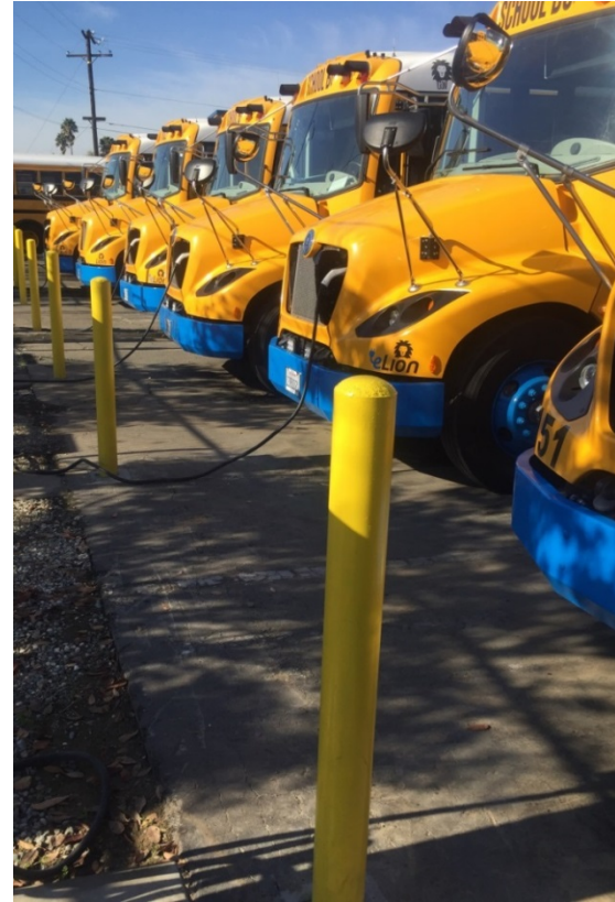
Twin Rivers Unified School District