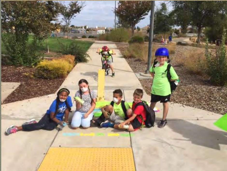
McGarvey Elementary Pedestrian Chalk Painting September 2017