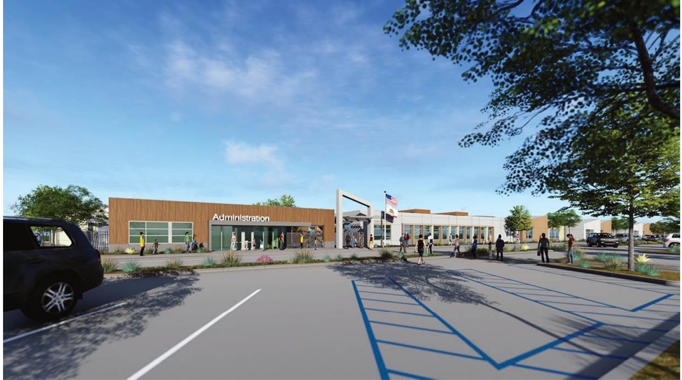
New Elementary School in Foster City - View from Shell Blvd, of Pedestrian Entrance and Vehicular Exit