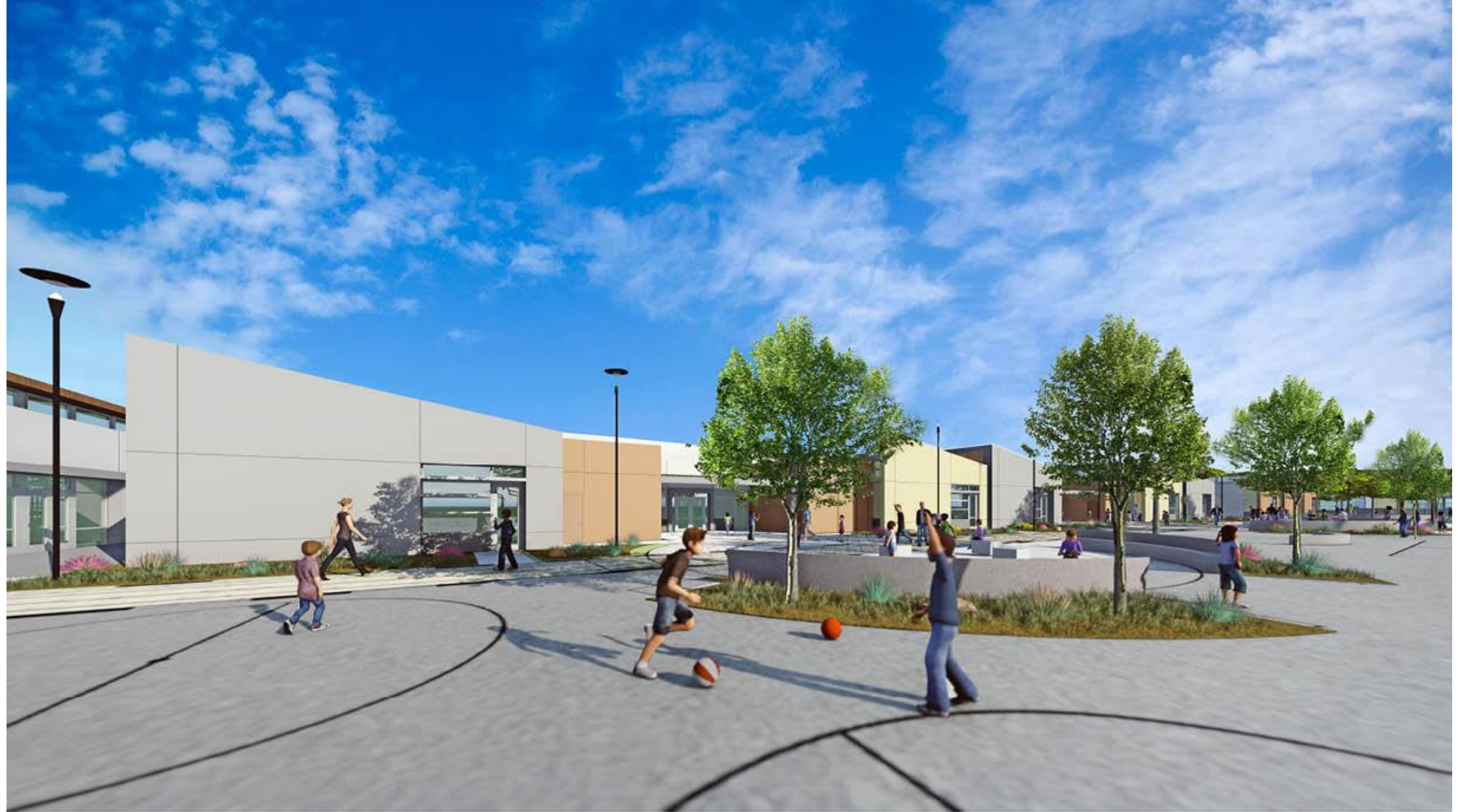
New Elementary School in Foster City - View from Playground, Looking East, of Outdoor Learning Node and Classrooms