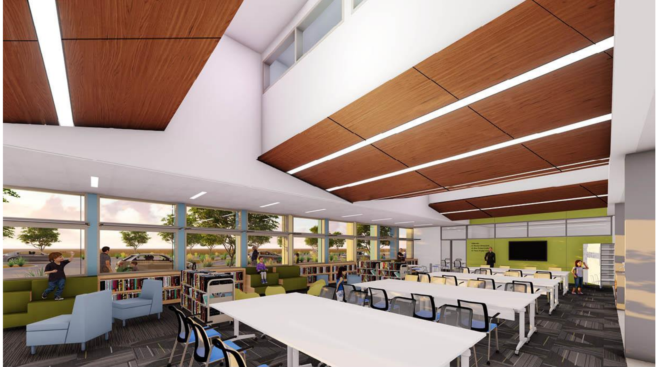
New Elementary School in Foster City - Interior View of Library