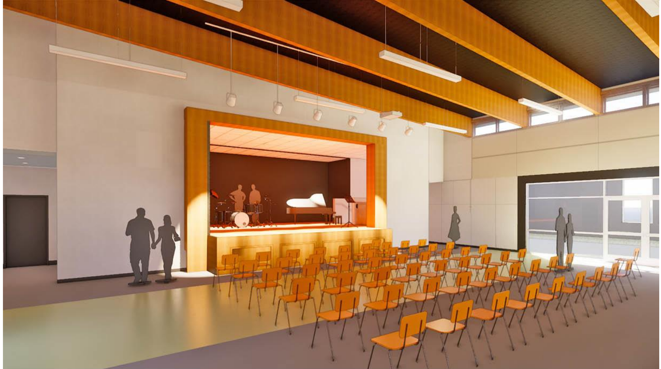
New Elementary School in Foster City - Interior View of Multipurpose Building