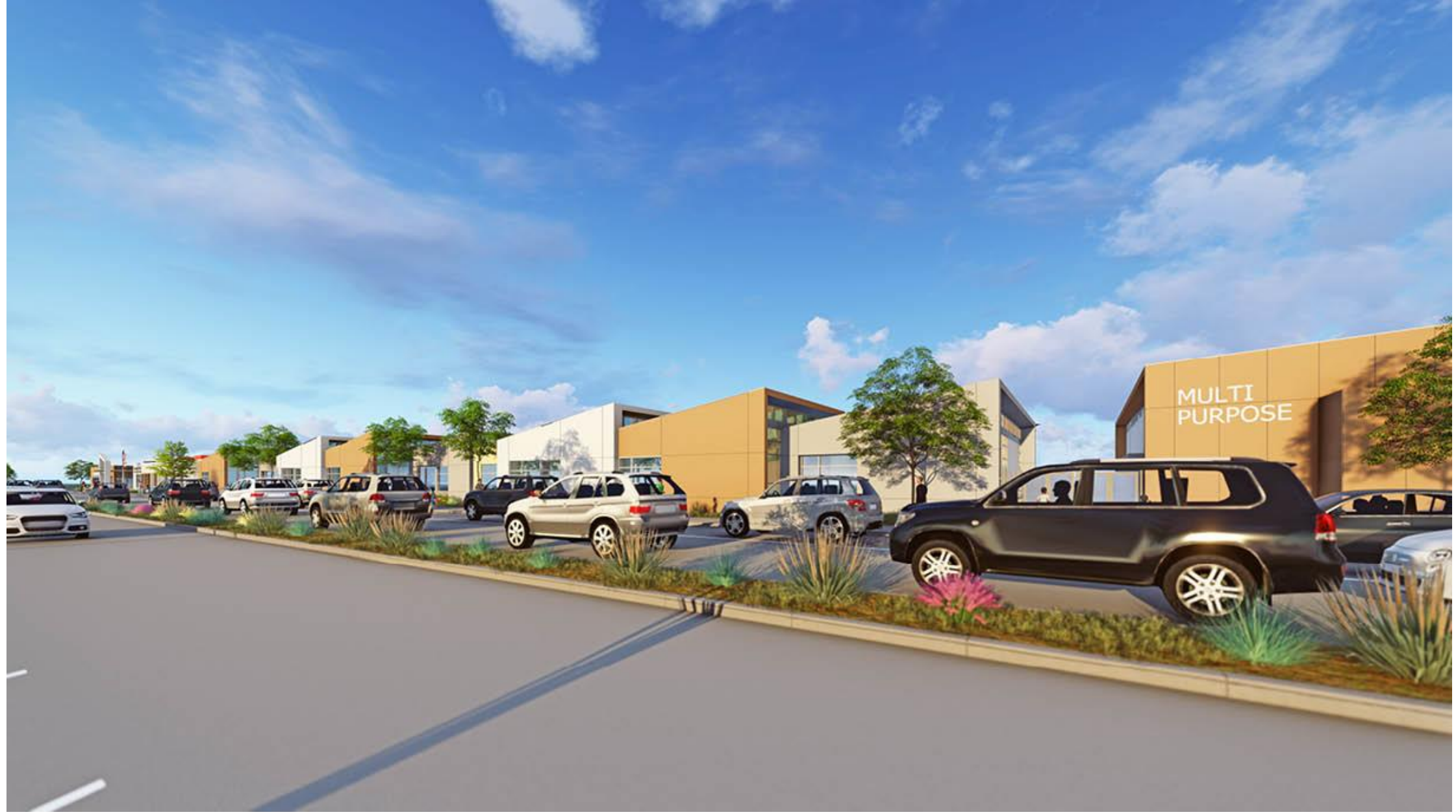
New Elementary School in Foster City - View from Shell Blvd, Looking South-West, of Passing & Drop-off Queuing Lanes