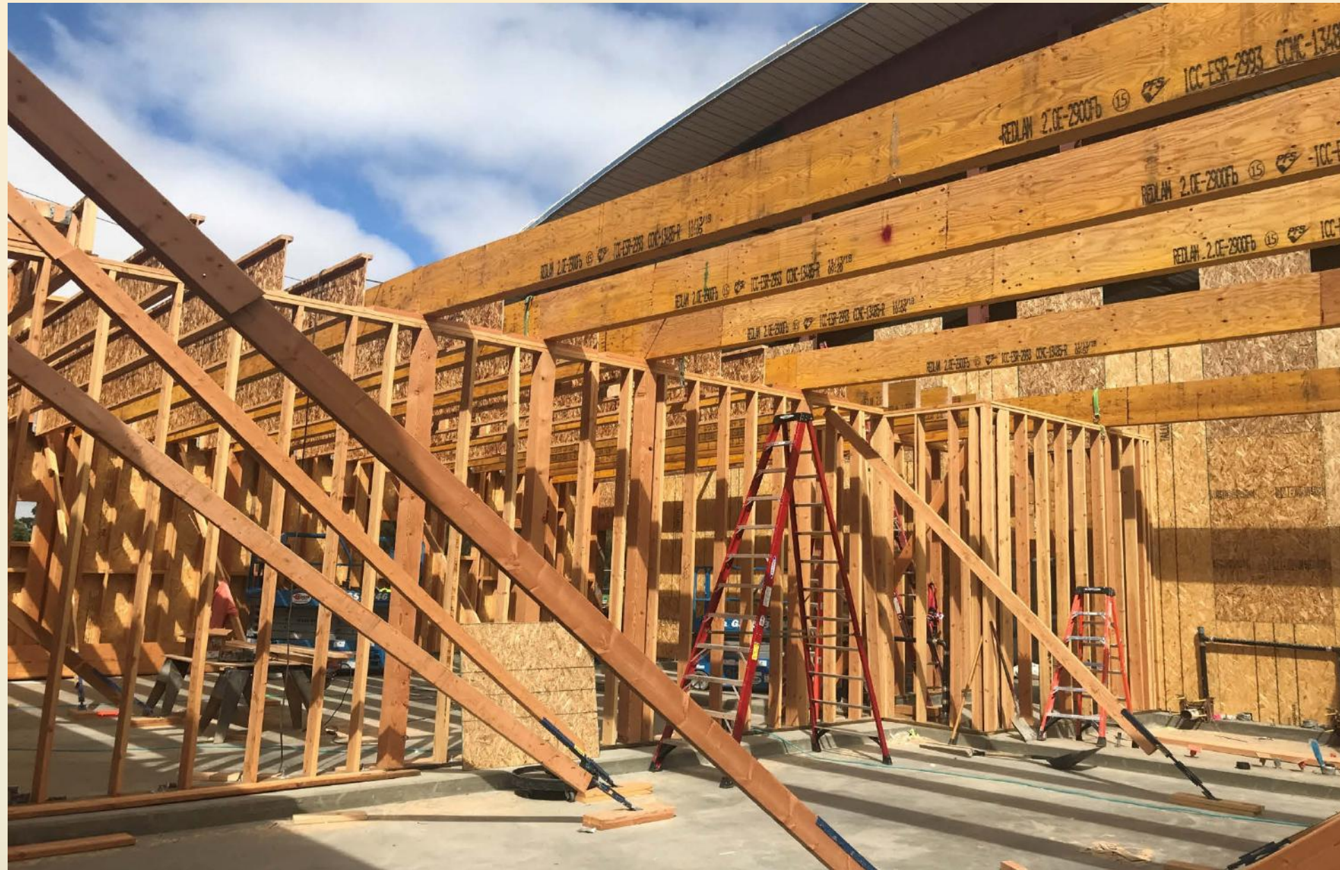
Installing Glulam Beams over locker room