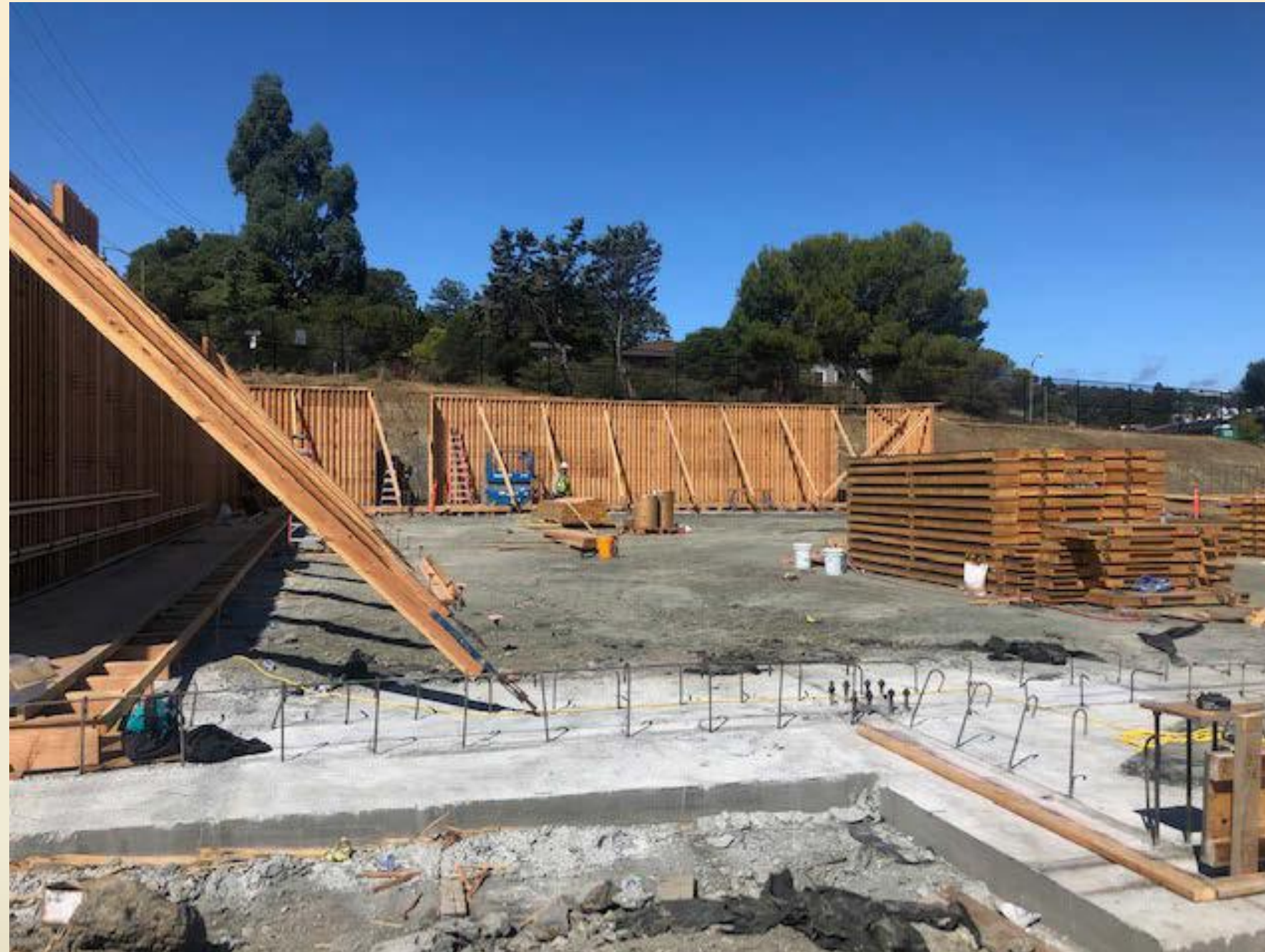
Framing for the shoring of the hill at 36 th and the Abbott Driveway