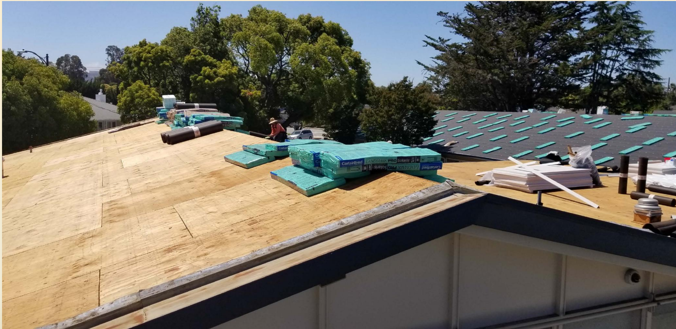
Typical roof installation at Classroom Wings