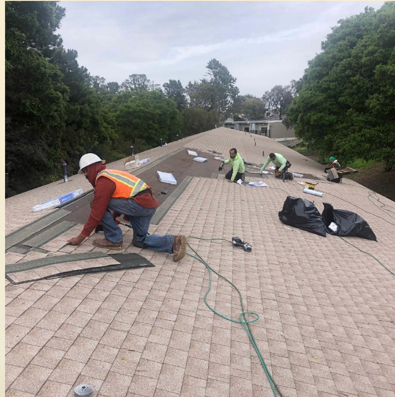
Typical new roof installation at all Wings