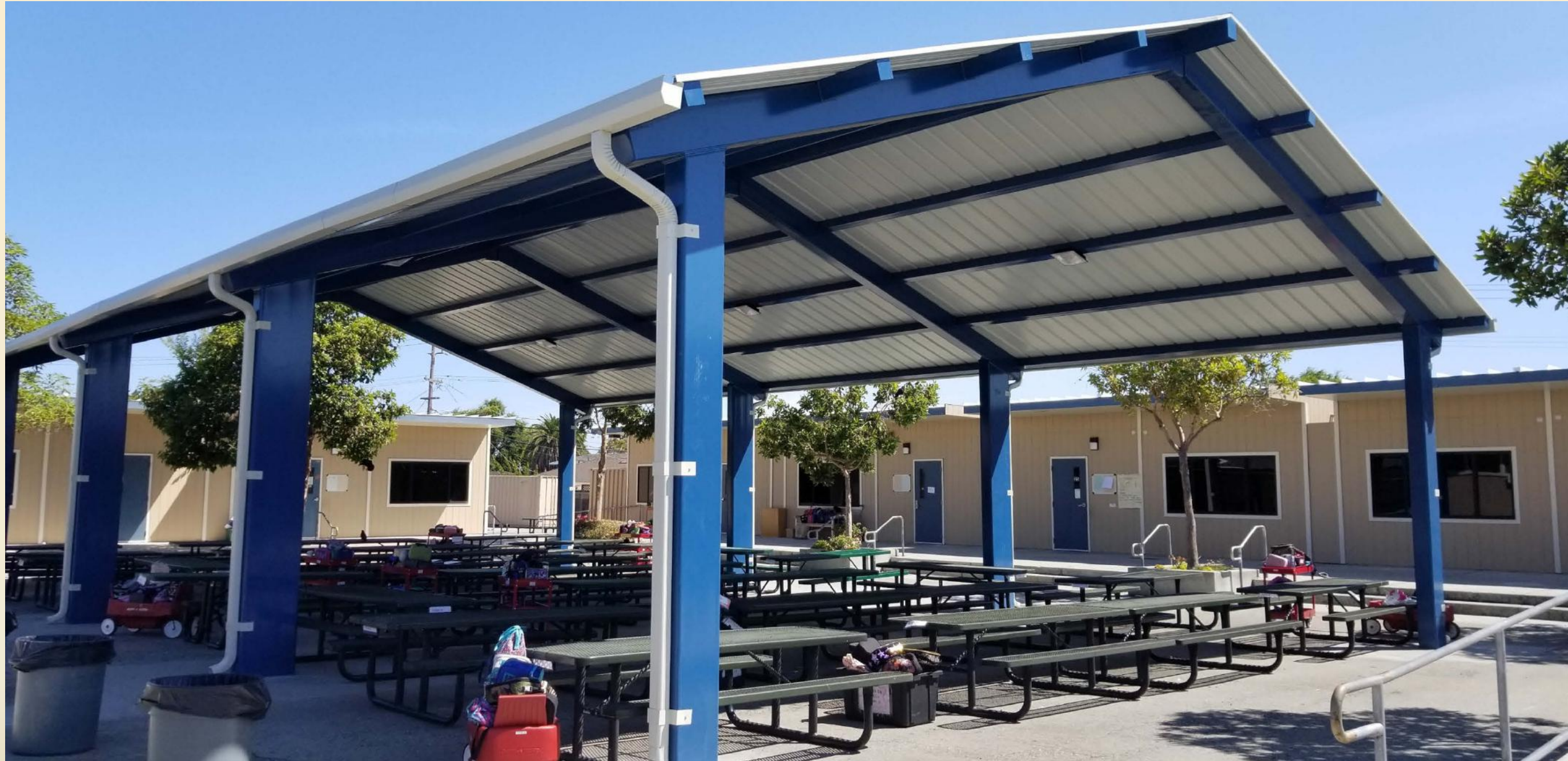
Completed Shade structure with inside lighting