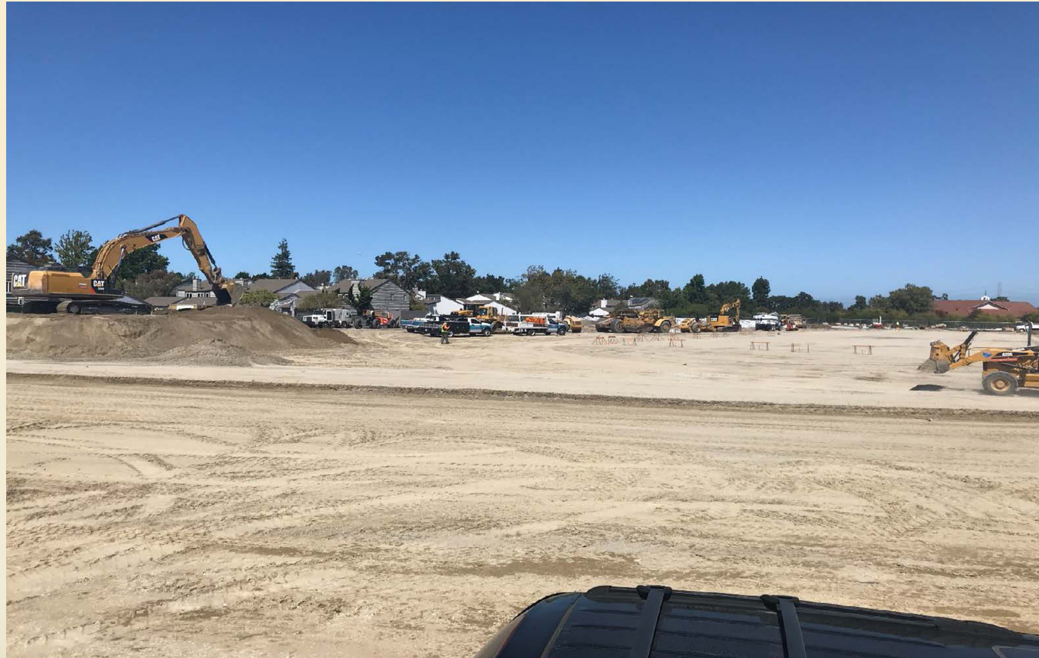
Site View Week 2