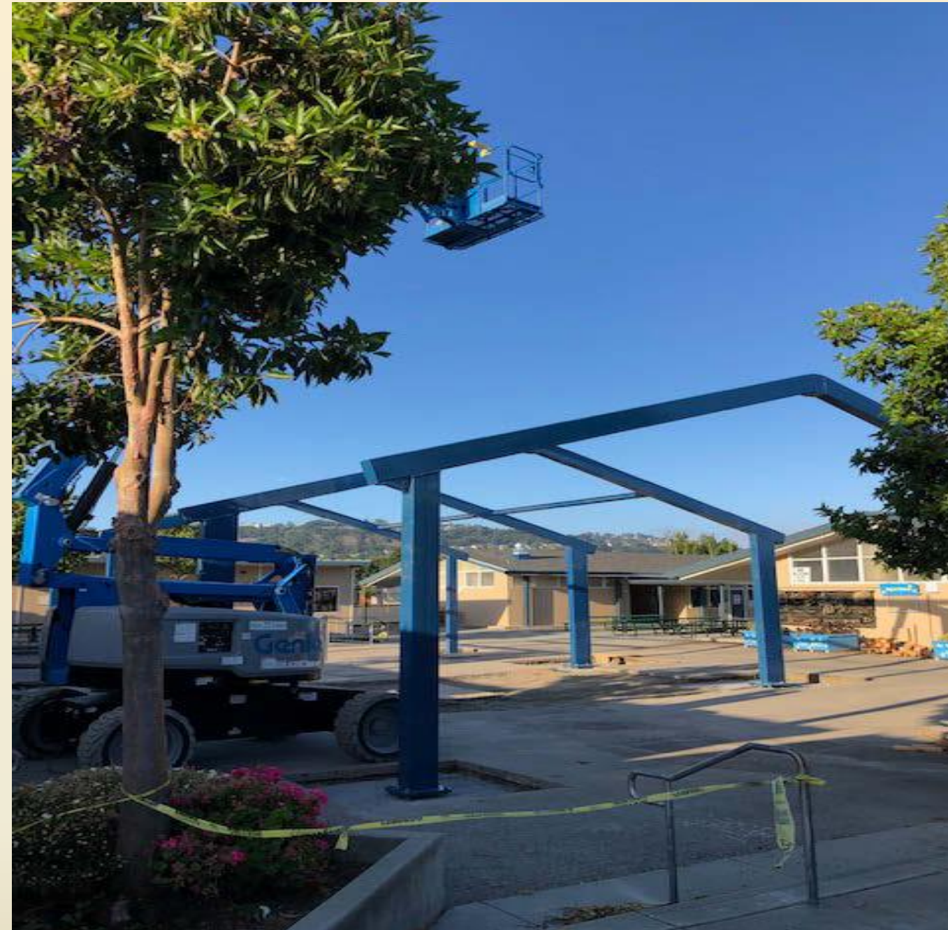
Assembly of steel frames for the Shade Structure