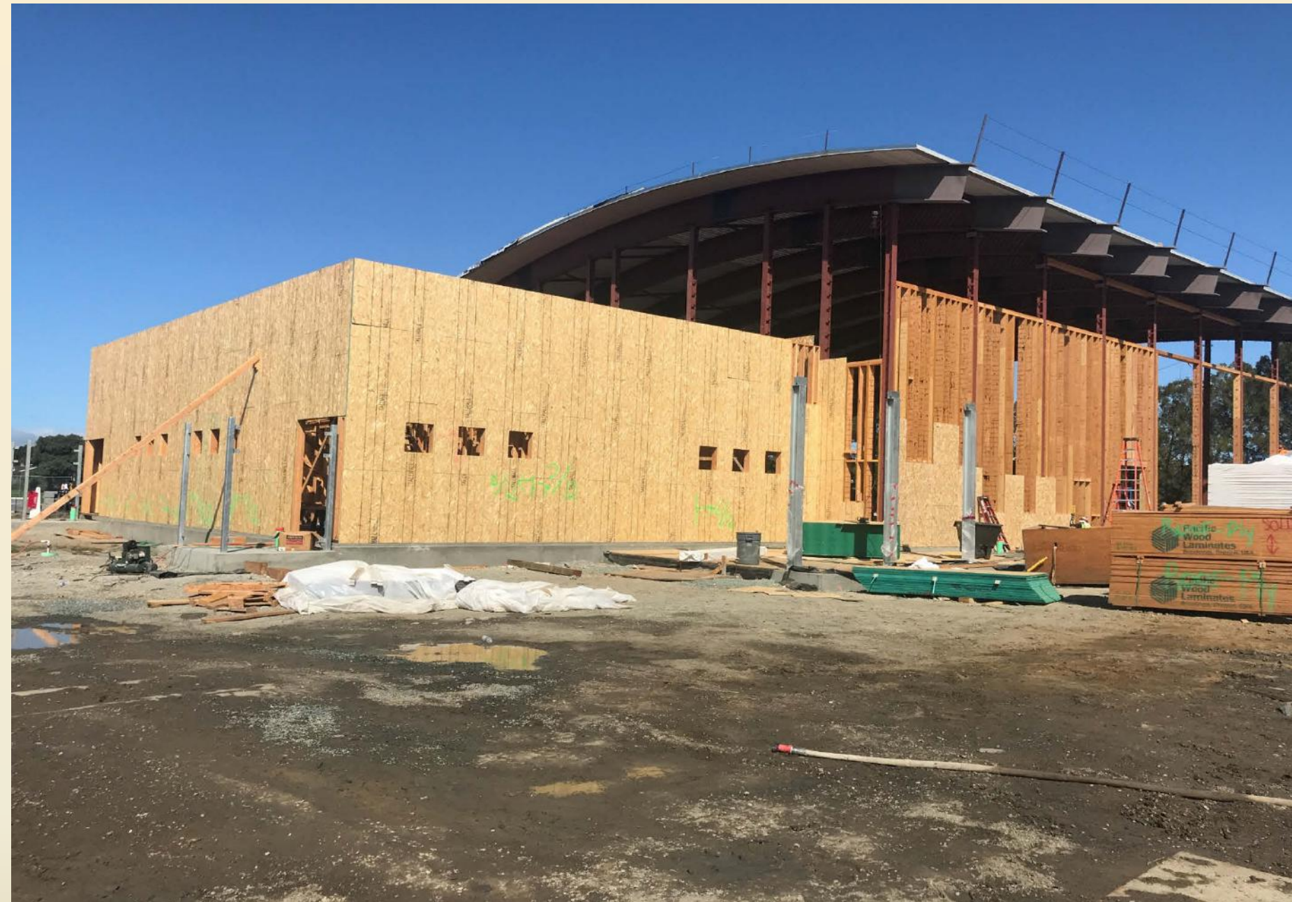
Gym Framing and Locker Room Framing