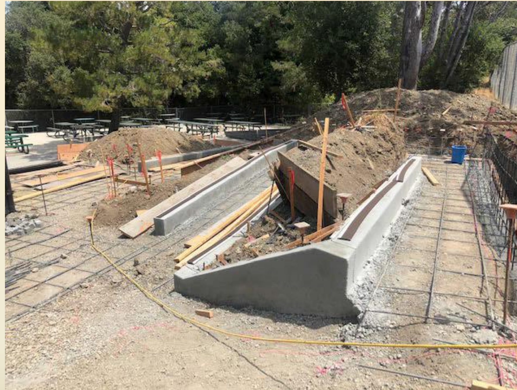
Ramp leading to the Lunch Grove, completed August 10, 2019