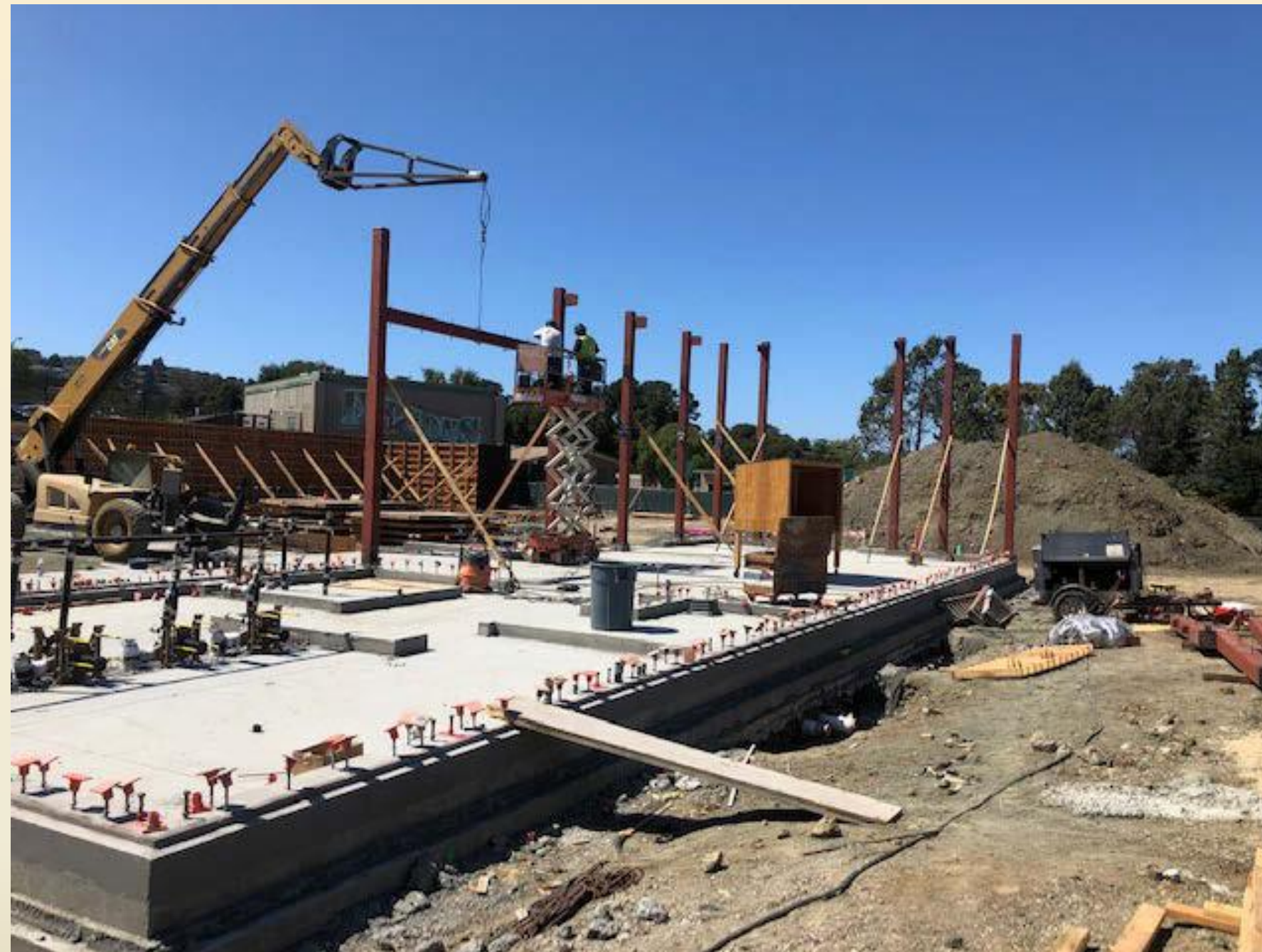
Gym lobby view towards North-West