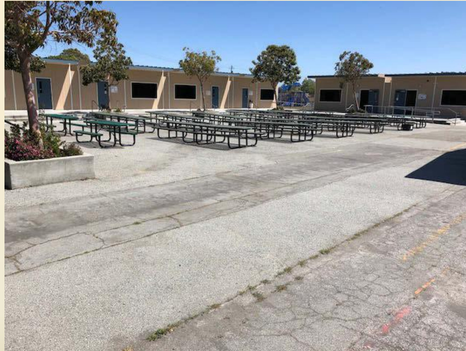
Existing lunch courtyard prior to Shade Structure installation