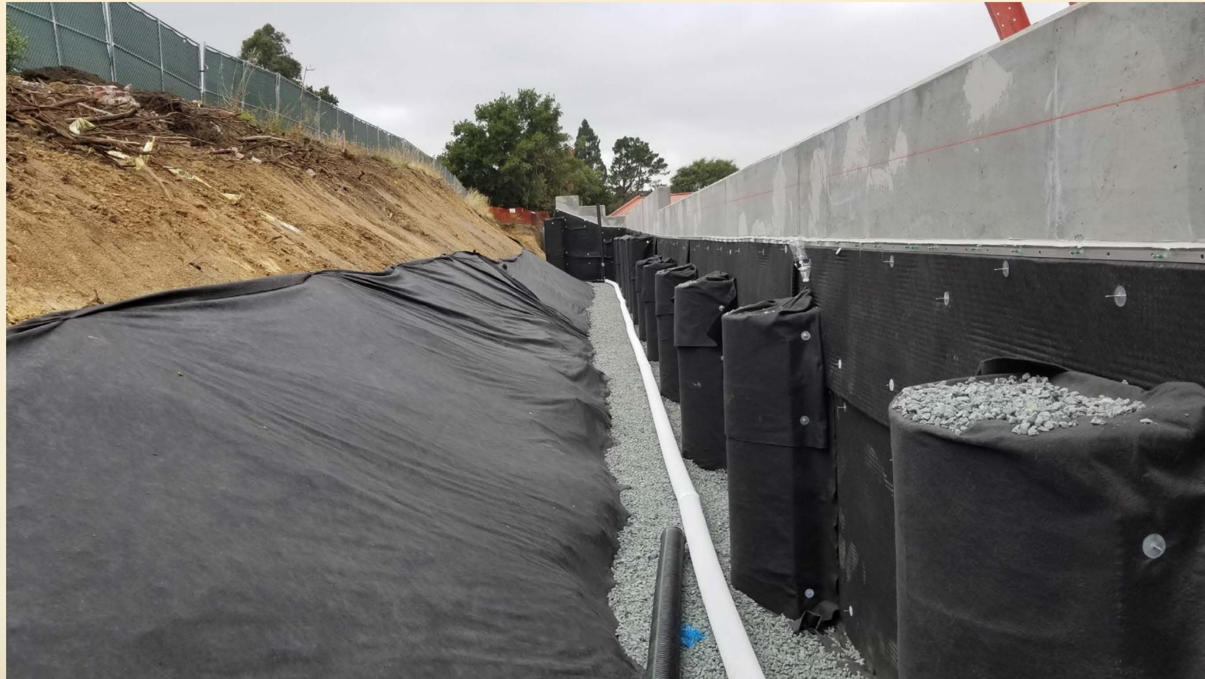
Drainage system behind retaining wall