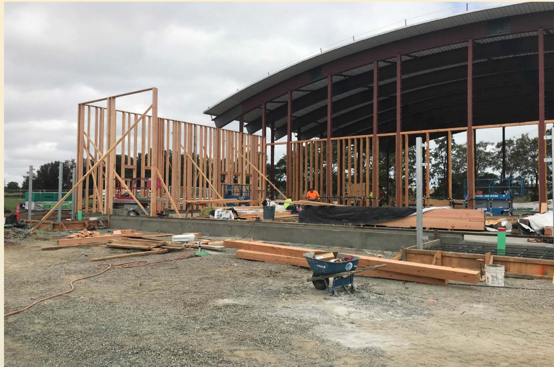
Gym Steel and Locker room framing starting