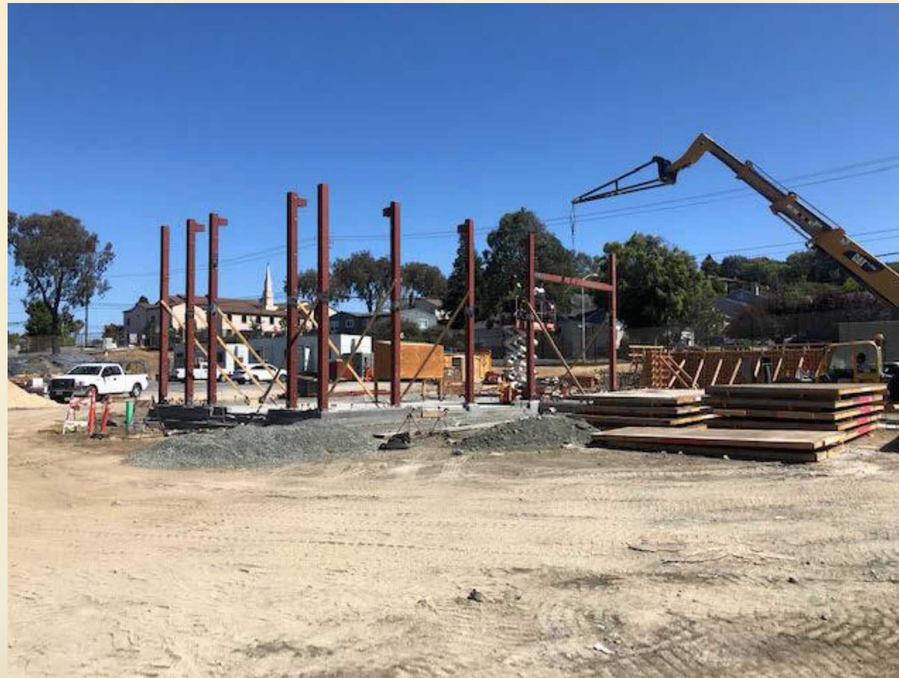
Gym lobby view towards South-East