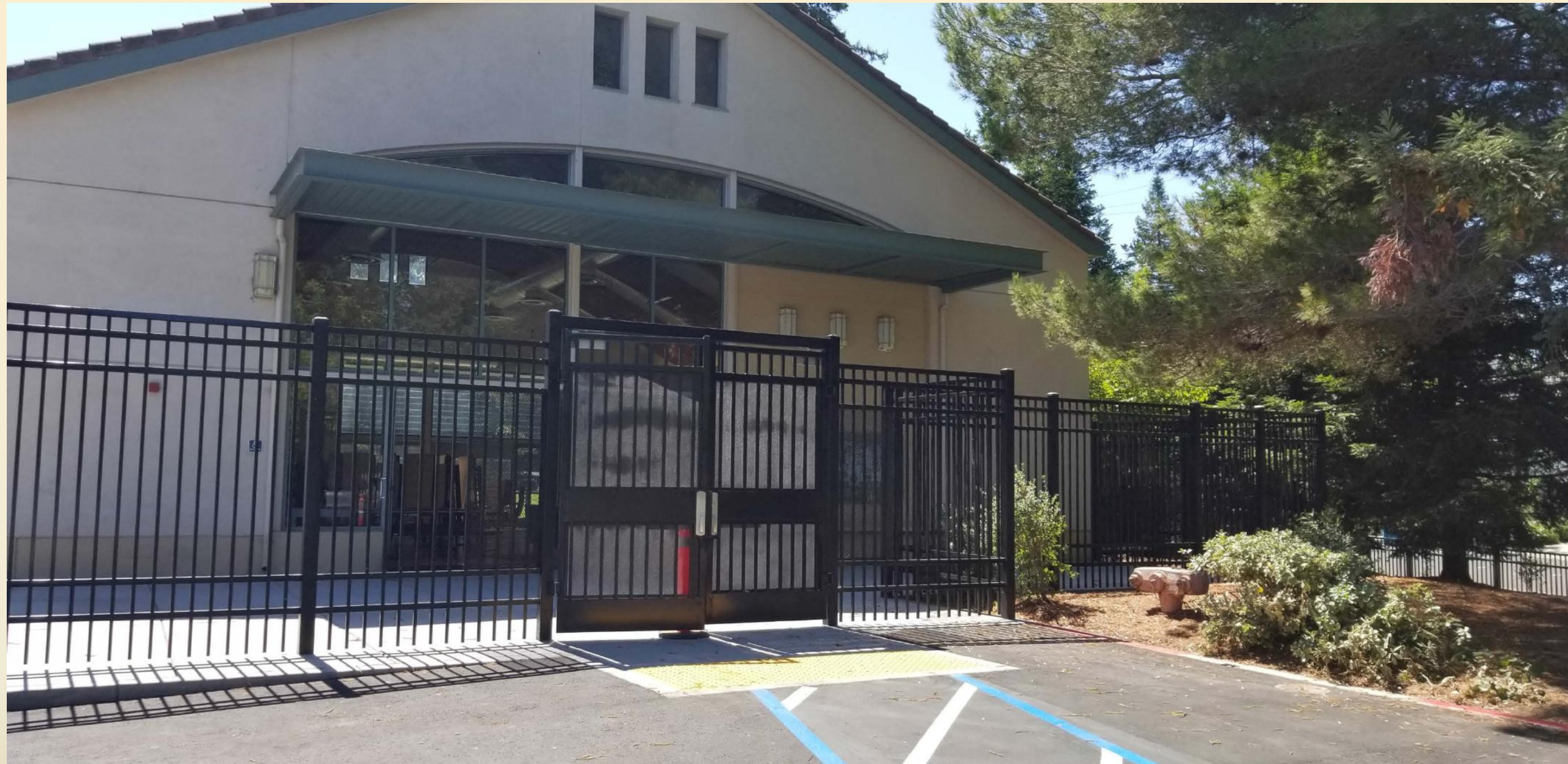
Newly installed ornamental fencing