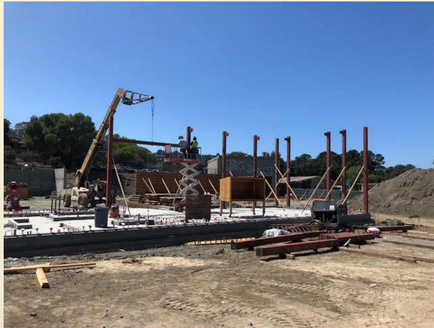
Steel columns framing the lobby of the Gym