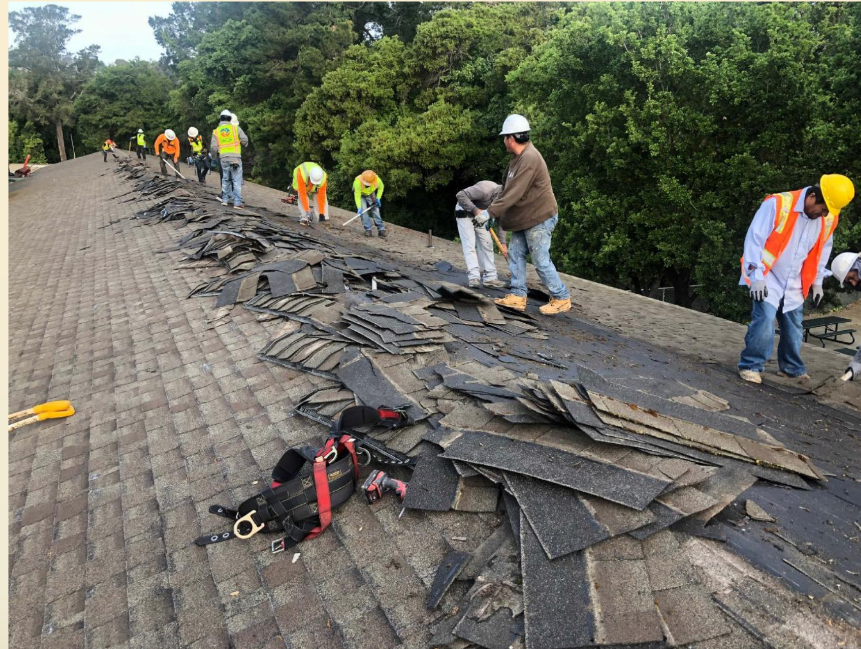
Roof demolition of Wing 3