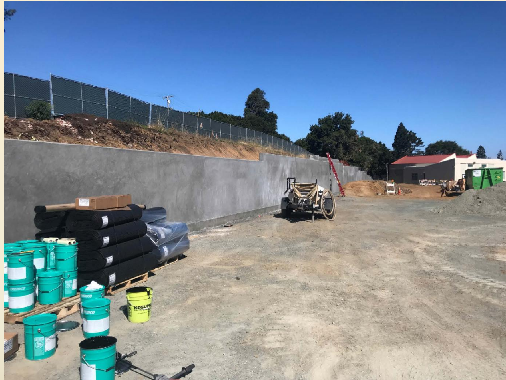
Retaining wall separating Borel Park from the school.