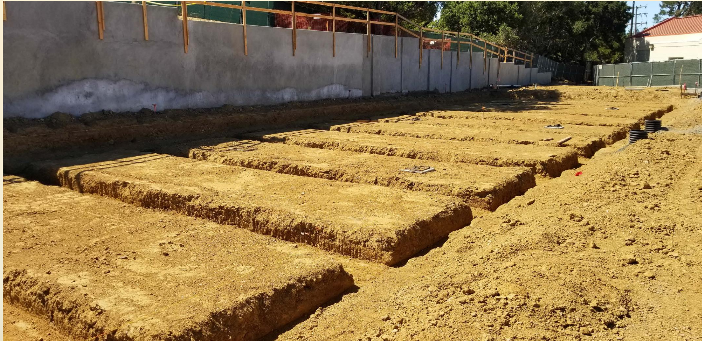
Trenches ready for modular building footings