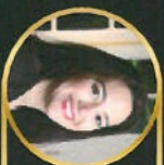
General Session 3 Erin Gruwell Date: Friday, March 6