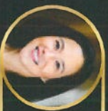
A Skype Conversation with Angela Duckworth Date: Wednesday, March 4

Aristotle defined character as the intentions and actions that benefit the individual and society at large. Character is not one thing—it's many. In this talk, Character Lab Founder and CEO Angela Duckworth explains the importance of three different kinds of character strengths: Interpersonal strengths like gratitude enable harmonious relationships with other people. Intrapersonal strengths like grit and self-control enable achievement. Intellectual strengths like curiosity enable a fertile and free life of the mind. To develop any of these character strengths requires motivation, skill, and opportunity. Using grit as a case study, Duckworth shows how young people can learn both.