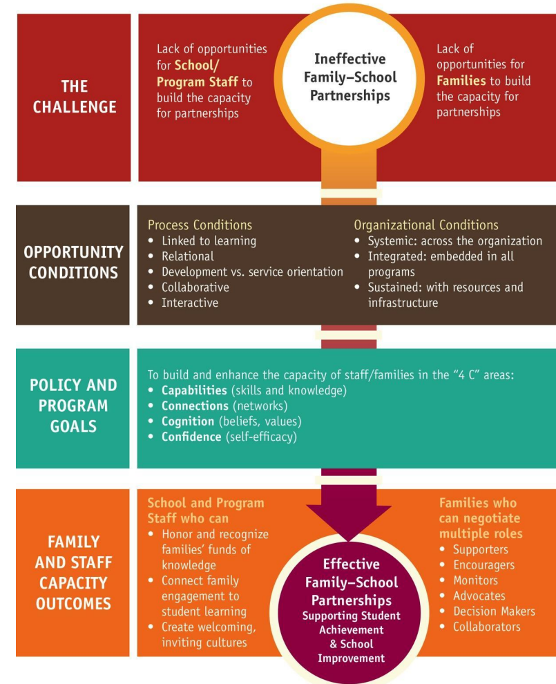
The Dual Capacity-Building Framework for Family-School Partnerships