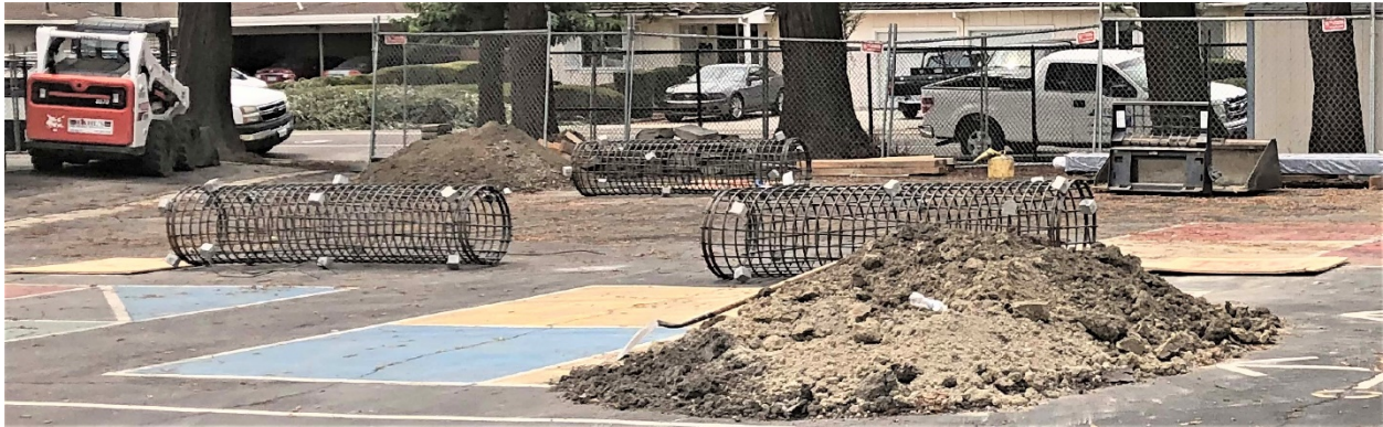
Shade Structure Column Footing Reinforcing, Haman E.S.