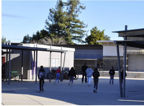
Fisher Exploring Campus