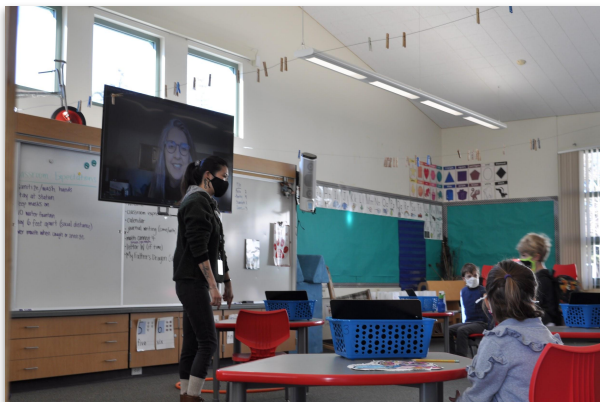
Van Meter Substitute Support