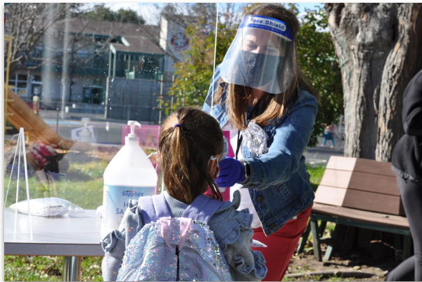
Van Meter Temperature Check