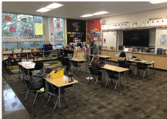
Lexington Roomers & Zoomers