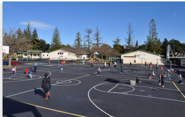
Van Meter Recess