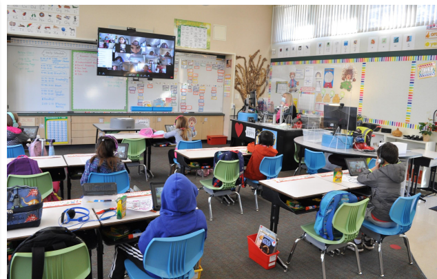
Daves Avenue Roomers & Zoomers