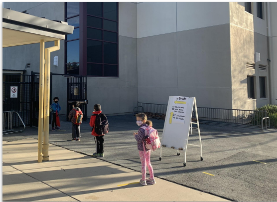
Blossom Hill Line-up