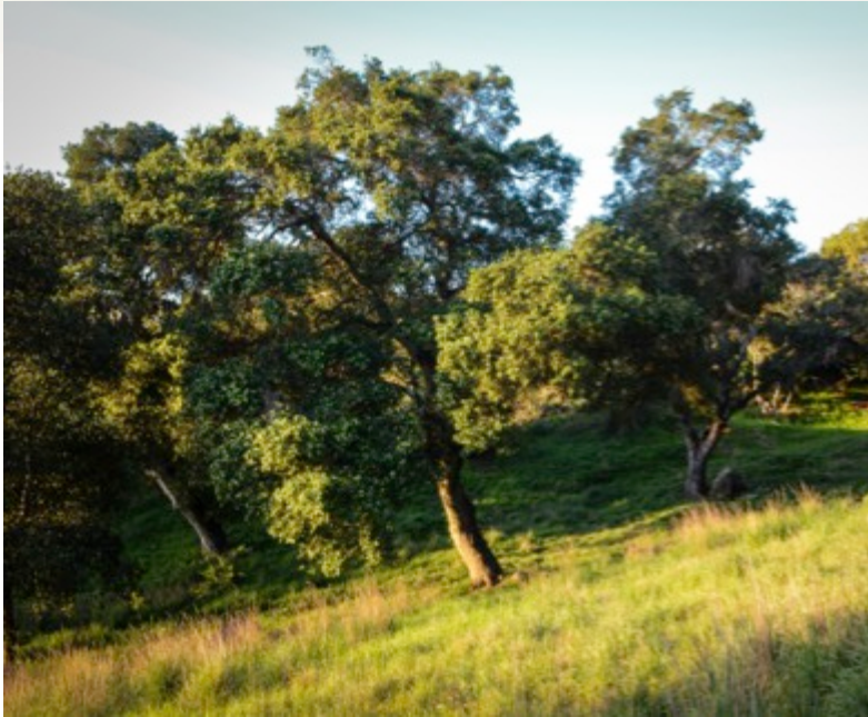
Majestic oak trees on Black Mountain