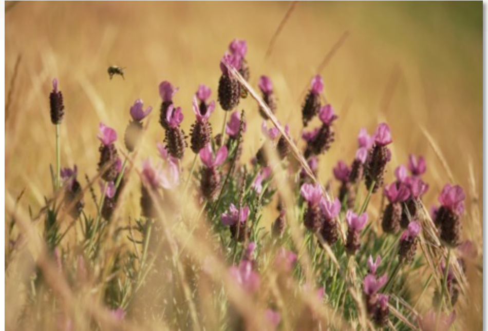
Wildflowers provide a habitat for honey bees