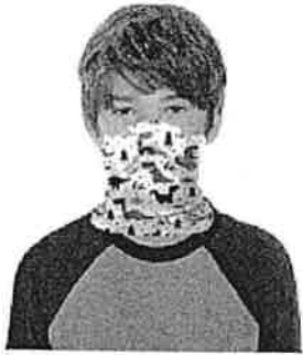
kids gaiter.jpg 12K