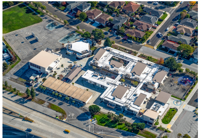
Fiesta Gardens International School