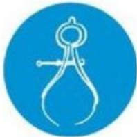
Engineering & Design Industry