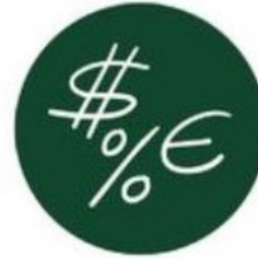
Finance and Business