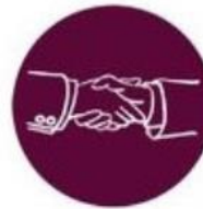
Marketing, Sales, & Service