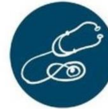
Health Science & Medical Technology