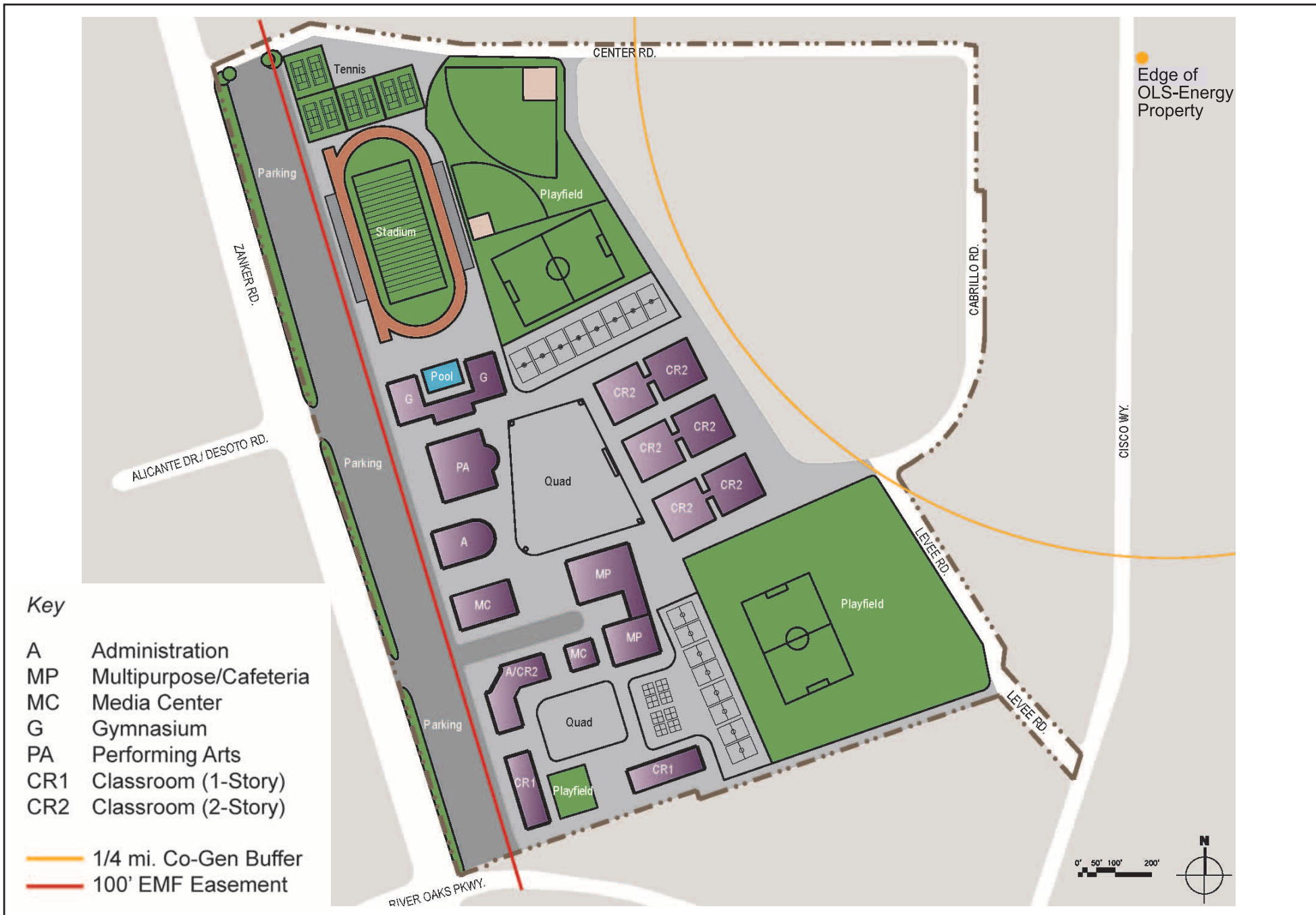
CONCEPTUAL SITE PLAN