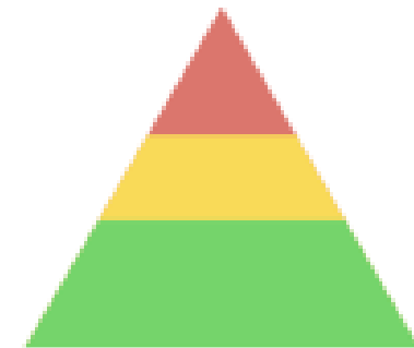
Spring D3 (Elem)