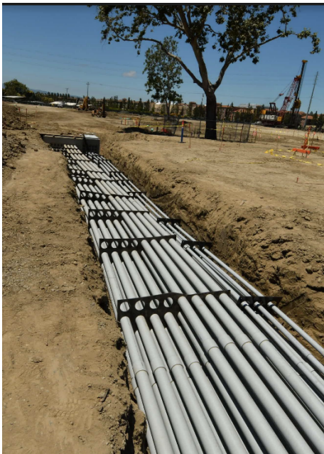
A portion of the 16 mile underground conduit system.

DSA issued approval to commence footing excavation on the elementary school Office and Kindergarten buildings at 6:00PM on Monday, July 22, 2019. Excavating commenced the following morning. The final approval process for the Cement Deep Soil Mixing ground improvement portion of the project – after sampling by the contractor and testing by the independent testing laboratory, acceptance by the Geotechnical Engineer and approval by the California Geologic Survey (CGS) – was not what was expected. The approval process was a seven-day-a-week process by all parties. All elementary school buildings have been approved. Approval of the middle school buildings is continuing.