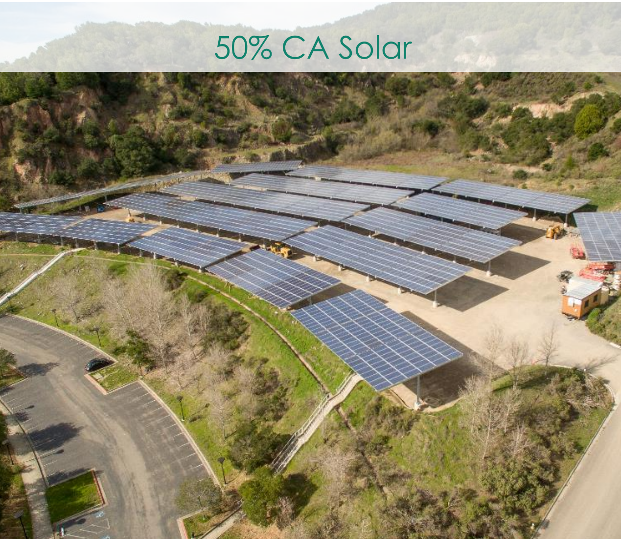
50% CA Solar