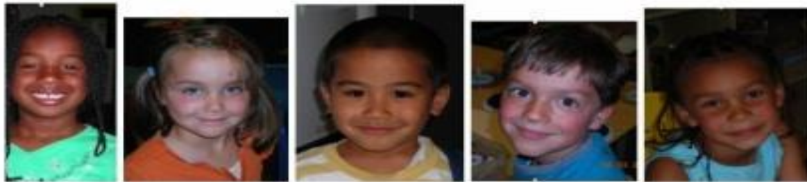
VISION 2020 GENERATION: KINDERGARTENERS - CLASS OF 2007-2008