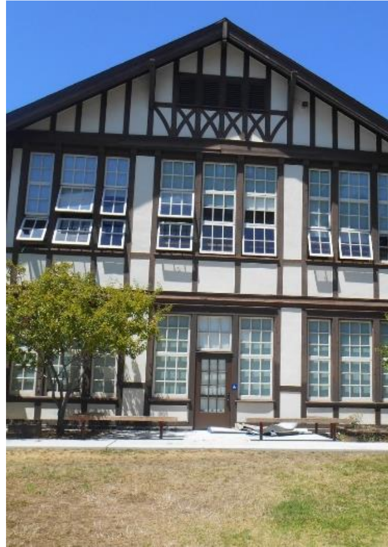
John Muir E.S.